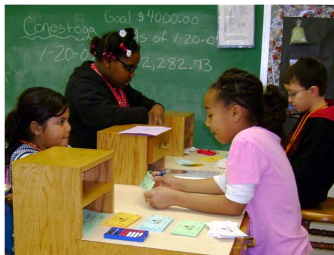
Financial Literacy in Action at a MicroSociety Magnet School Bank

At the core of the program are the “essential elements”: an internal currency, retail and labor markets, government agencies, non-profits, businesses, and private and public property, along with enhanced parent and business community involvement, a hallmark of all MicroSociety programs.