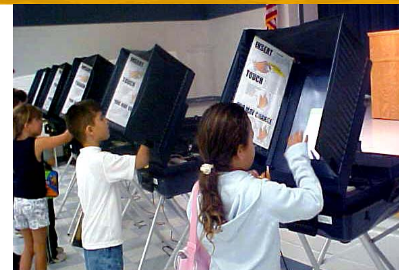
Students exercising their citizenship rights by voting at a MicroSociety Magnet School